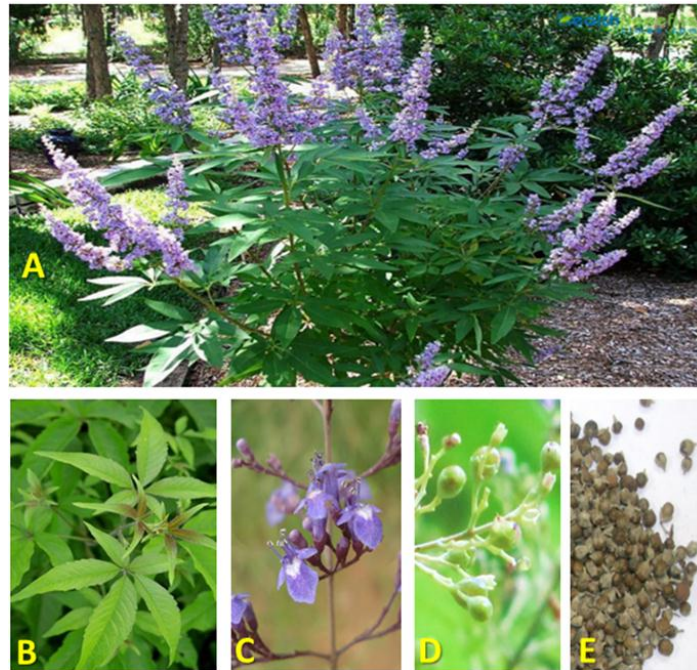
Figure 6. Vitex negundo : (A) whole plant, (B) leaves, (C) flowers, (D) fruits, (E) seeds.