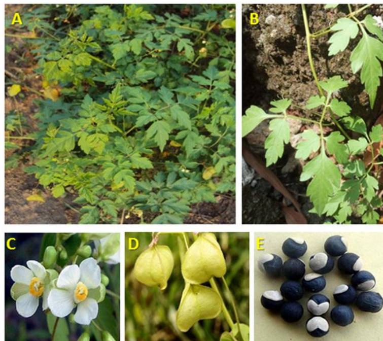
Figure 1. Cardiospermum helicacabum : (A) whole plant, (B) leaves, (C) flowers, (D) fruits, (E) seeds.

The description of the plant is found in Jyautishmati as emetic, laxative, stomachic, and rubefacient and is prescribed in treatment of rheumatism, nervous diseases, piles, etc. The leaves are used in amenorrhoea ( Figure 1 ). On the Malabar Coast the leaves are administered for pulmonic complaints and root is considered aperient (Pettit, 2016). Leaves are administered both externally and internally rubbed up with castor-oil, and applying this paste to reduce swellings and tumors (Maiden, 1889). In Taiwan, leaves are applied to swellings along with salt. In Bangladesh, pills made from a paste of the whole plant are used to treat asthma (Gurib-Fakim and Sewraj, 1992). C. helicacabum is also used to treat stiffness of limbs and snakebite. Young leaves can be cooked as vegetables (Gopalakrishnan et al., 1976). The root is diuretic and demulcent and is used to treat rheumatism. The leaves are reported to be used for washing clothes and the head (Rojo and Pitargue, 1999). The seed oil has insect repellent properties and an antifeedant action on insects.