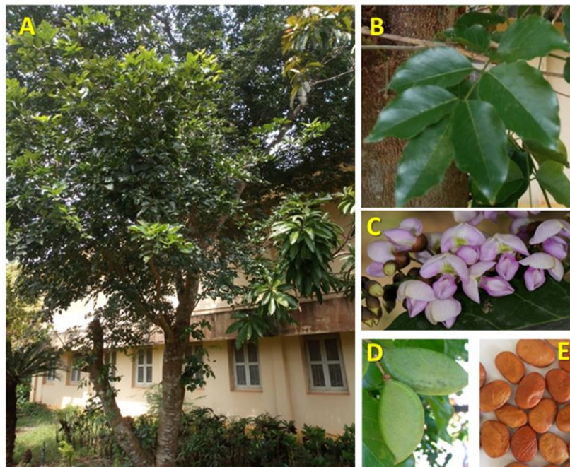
Figure 3. Pongamia pinnata : (A) whole plant, (B) leaves, (C) flowers, (D) fruits, (E) seeds.

Pharmacognostical characters show that the pods are compressed, woody, indehiscent, yellowish gray when ripe, varying in size and shape, elliptic to obliquely oblong, 4.0-7.5 cm long and 1.7-3.2 cm broad with short curved beak. Number of seed usually found 1 rarely 2, elliptical or reniform in shape and size 1.7-2.0 cm long and 1.2-1.8 cm broad, wrinkled with reddish brown leathery testa (Meera et al., 2003) (Figure 3). A brown to yellowish brown powder with a faint characteristic odour and bitter unpleasant taste. The epidermis is composed of a layer of conical and thick walled palisade cells with a thick cuticle. The epidermal cells appeared more regular, polygonal and yellowish-brown (Kumar et al., 2013).