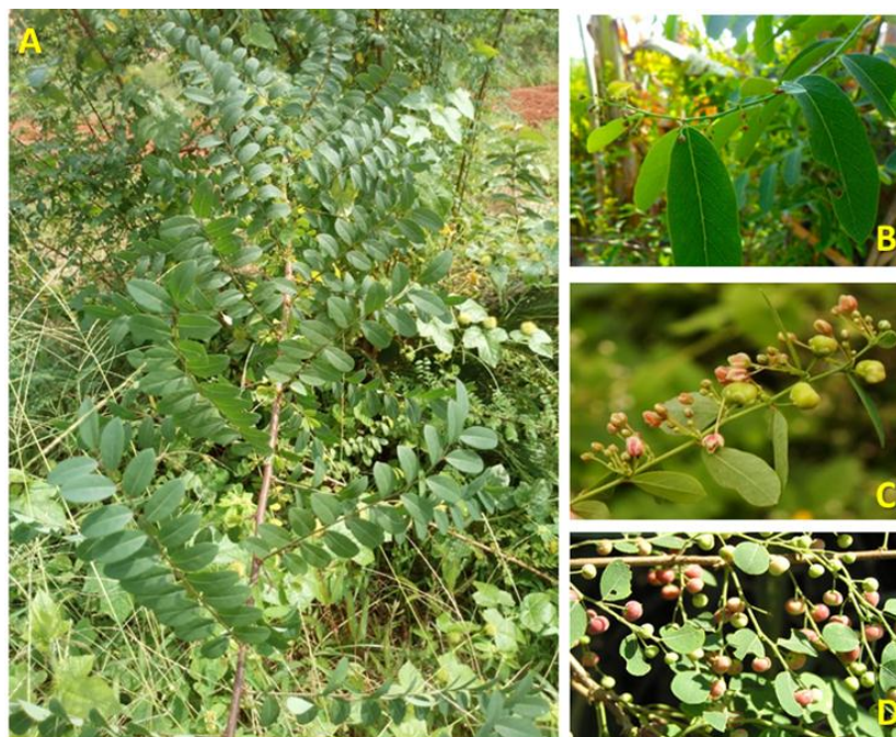
Figure 2. Kirganelia reticulata : (A) whole plant, (B) leaves, (C) flowers, (D) fruits.

Kirganelia reticulata is also known as Phyllanthus reticulatus (Poir) (Unander et al., 1990) belongs to family Euphorbiaceae (Youngken, 1950) ( Figure 2 ). It is a shrub or small tree to 5-10 m tall, found all over India and is cultivated worldwide in dry forest upto 800-meter height. It is indigenous to Africa and it has reached temperate and tropical area of Asia also (Agrawal and Paridhavi, 2013; Datta and Datta, 1980). Kirganelia is a large Genus comprising about 750 species in tropical and subtropical regions (Gokhale and Kokate, 2008) with about 150 species in mainland tropical Africa and the Indian Ocean islands (Soni et al., 2013).